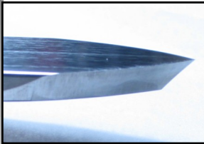
Photo 1: Side Profile. 1" wide x 0.25" thick, Bevel angle ~45 degrees

Do you drool over fine curves? Are you sanding out ridges & transitions in your turnings?